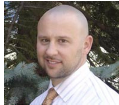
DR. GREGG A. PIZZI & ASSOCIATES, P.A.